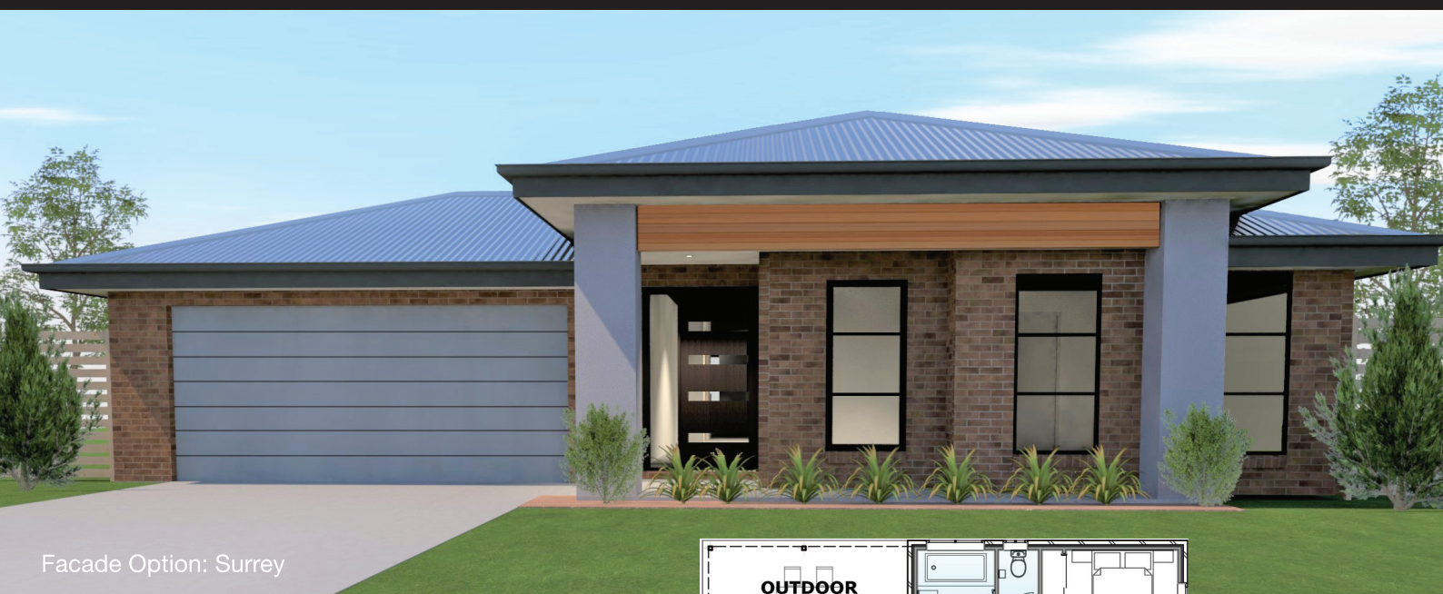
Facade Option: Surrey